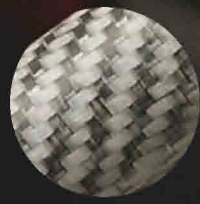
AL woven insert