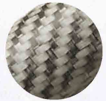
AL woven insert