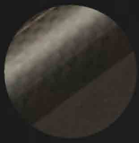
IK woven insert