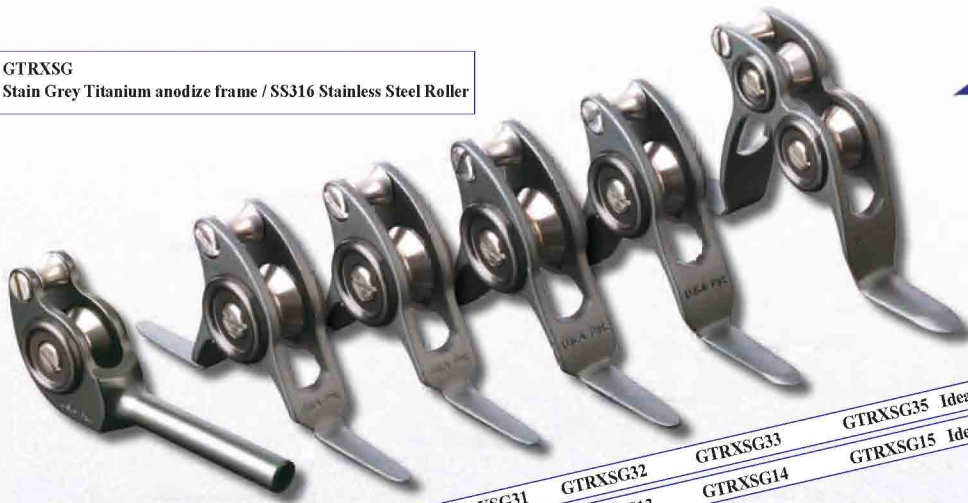
GTRXSG Stain Grey Titanium anodize frame / SS316 Stainless Steel Roller