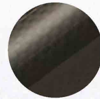
IK woven insert