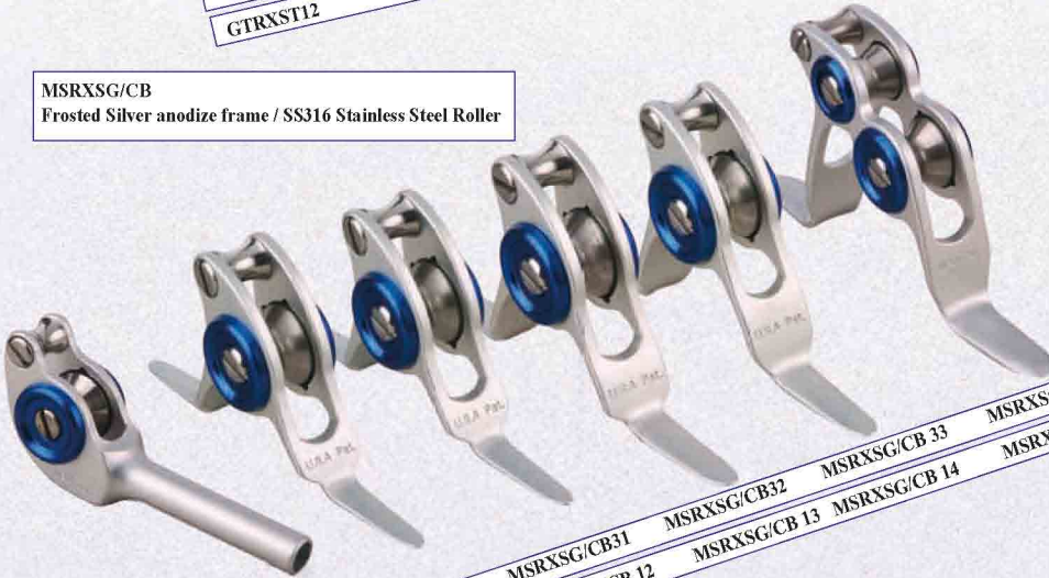
MSRXSG/CB Frosted Silver anodize frame / SS316 Stainless Steel Roller