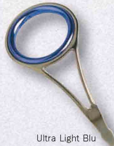
Ultra Light Blu